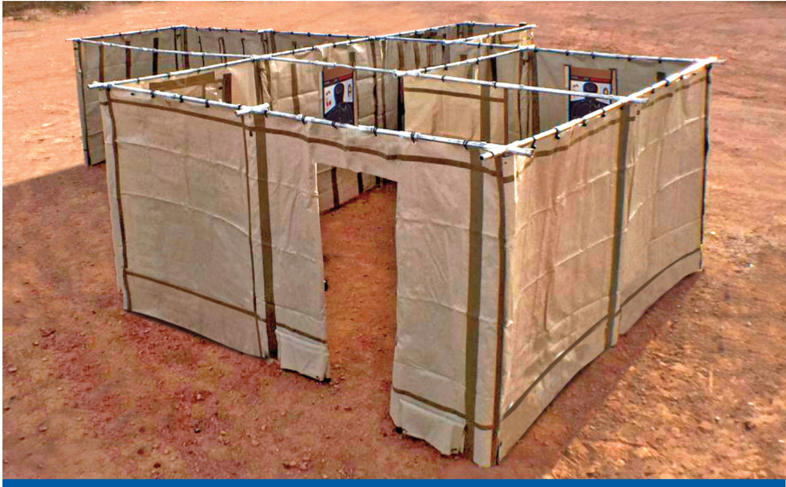
A Portable, Versatile and Easy to Set Up Training Facility